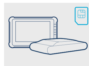
Telematics box and navigation device with SIM card